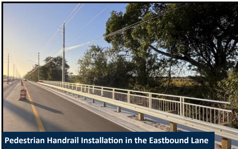
Pedestrian Handrail Installation in the Eastbound Lane